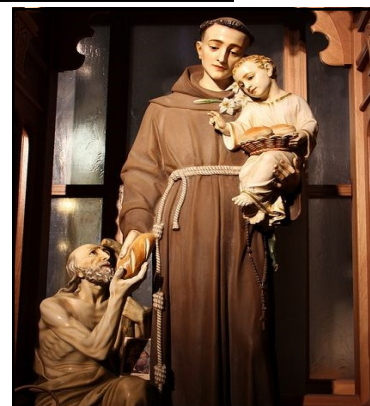
Through the intercession of St. Anthony

WE ENDEAVOR TO SHARE OUR TIME, TALENT AND TREASURE TO PROCLAIM THE GOSPEL OF JESUS CHRIST, AND AS HIS CHURCH, TO GROW IN FAITH AND LOVE, TO ACT IN CHARITY AND TO SERVE ALL OF HIS PEOPLE.