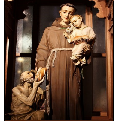
Through the intercession of St. Anthony

WE ENDEAVOR TO SHARE OUR TIME, TALENT AND TREASURE TO PROCLAIM THE GOSPEL OF JESUS CHRIST, AND AS HIS CHURCH, TO GROW IN FAITH AND LOVE, TO ACT IN CHARITY AND TO SERVE ALL OF HIS PEOPLE.