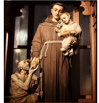
Through the intercession of St. Anthony

WE ENDEAVOR TO SHARE OUR TIME, TALENT AND TREASURE TO PROCLAIM THE GOSPEL OF JESUS CHRIST, AND AS HIS CHURCH, TO GROW IN FAITH AND LOVE, TO ACT IN CHARITY AND TO SERVE ALL OF HIS PEOPLE.