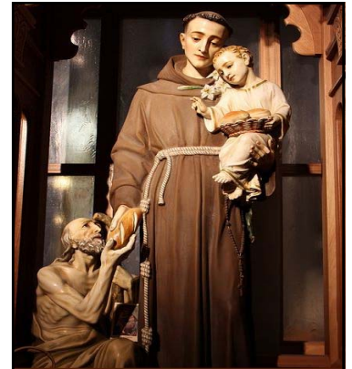
Through the intercession of St. Anthony

WE ENDEAVOR TO SHARE OUR TIME, TALENT AND TREASURE TO PROCLAIM THE GOSPEL OF JESUS CHRIST, AND AS HIS CHURCH, TO GROW IN FAITH AND LOVE, TO ACT IN CHARITY AND TO SERVE ALL OF HIS PEOPLE.