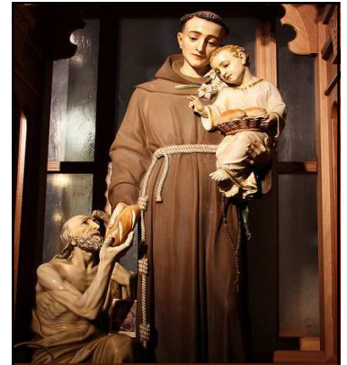
Through the intercession of St. Anthony

WE ENDEAVOR TO SHARE OUR TIME, TALENT AND TREASURE TO PROCLAIM THE GOSPEL OF JESUS CHRIST, AND AS HIS CHURCH, TO GROW IN FAITH AND LOVE, TO ACT IN CHARITY AND TO SERVE ALL OF HIS PEOPLE.